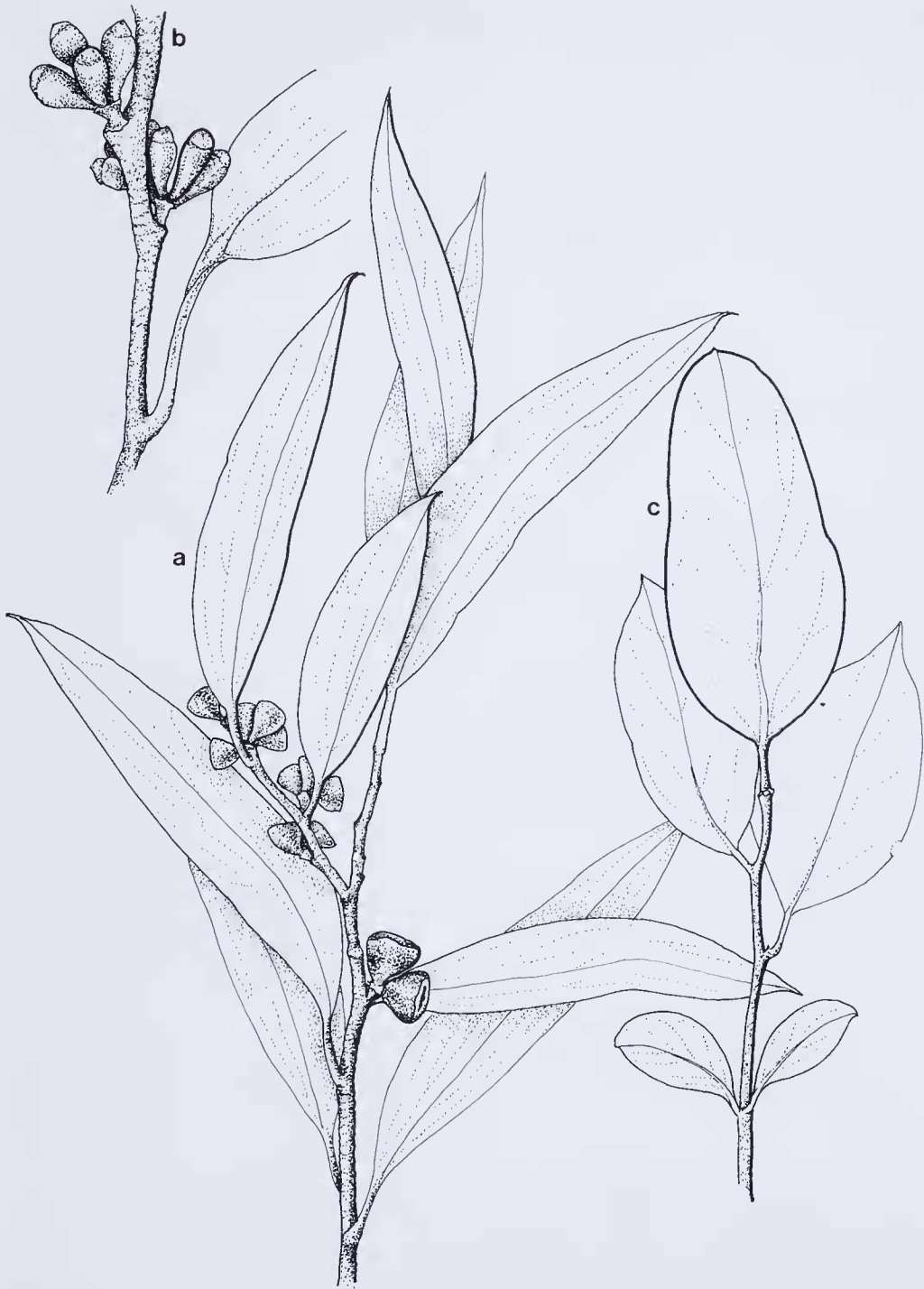
Fig. 1. Eucalyptus pauciflora ssp. acerina . a — fruiting branchlet \times 1 . b — buds \times 2 . c — seedling leaves \times 0.6 .